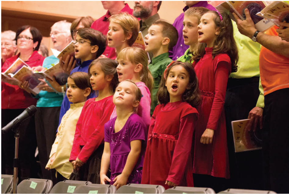
Inshallah Kids made their debut St. John's Lutheran church, Waterloo, in November.

As a result of the recent murders in a Quebec mosque and the new U.S. administration's proposed immigration ban, CTV Kitchener News highlighted our Inshallah Kids interfaith harmony choir as Local Heroes .