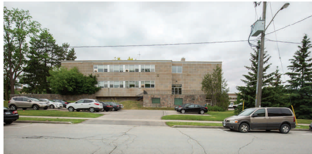
The southern wall: The seminary renewal plan calls for the mechanical room (bottom right) to be replaced with a new entrance.

A small addition to the south wall along Bricker Avenue will serve as a new main entrance which will face the community.