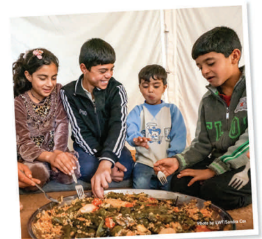
Make Room at the Table A group activity for World Refugee Day