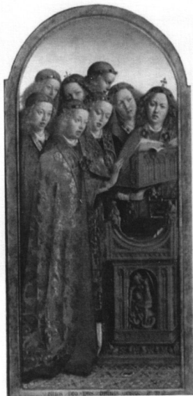
Jan van Eyck,