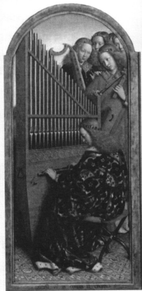
Ghent altarpiece, 1432